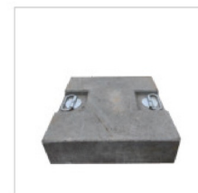
Zavorra per base Ballast for base cm. 50x50x10 Kg. 60