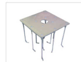
Base da cementare cm. 40x40