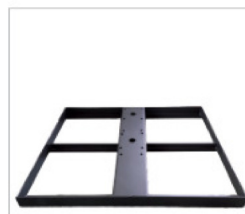
Base per zavorra Base for ballast cm. 121x105